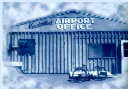
Association of California Airports To Educate, Advocate and Assist

5. HONORARY membership shall be conferred by action of the membership of ACA at large, to those individuals specifically recognized for their outstanding dedication and achievement in the field of airport development, management, operations or any related field of aviation. The Board of Directors must approve nominations prior to action by the membership.